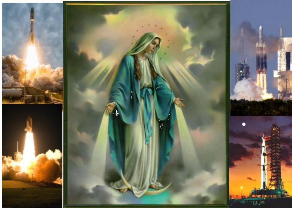
Our Lady of Space